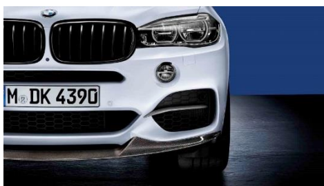
BMW M Performance Carbon Fibre diffuser and Aerodynamic attachments