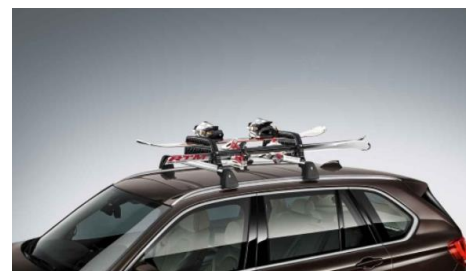
BMW Ski and snowboard holder