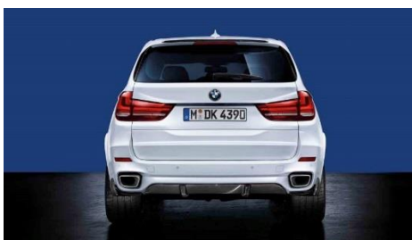
BMW M Performance Rear Carbon Fibre diffuser and Aerodynamic attachments