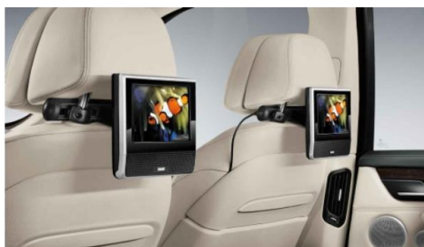
BMW Tablet DVD system

For more information, please contact your preferred BMW Dealer who will be pleased to advise you on the full range of Genuine BMW Accessories, or visit bmw.co.nz/accessories .