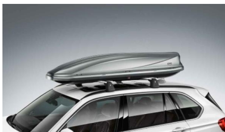
BMW Roof Racks and Roof Box