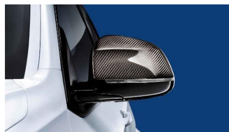
BMW M Performance exterior mirror caps carbon fiber