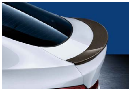
BMW Carbon Fibre rear spoiler