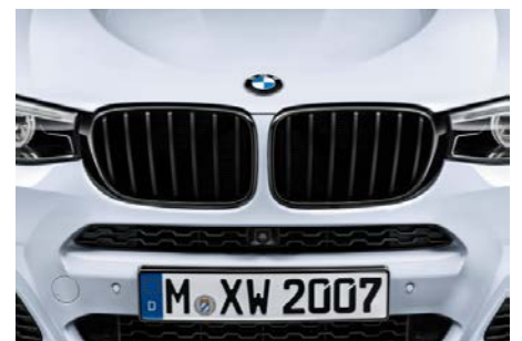
BMW Black Kidney Grilles