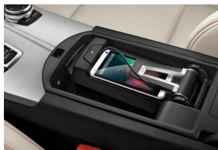
BMW Snap-in phone adapters to suit iPhone, Samsung and HTC One.