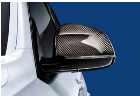
BMW Carbon Fibre Mirror Caps

For more information, please contact your preferred BMW Dealer who will be pleased to advise you on the full range of Genuine BMW Accessories, or visit bmw.co.nz/accessories .