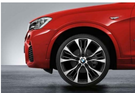
BMW Light alloy wheels 599M 21"