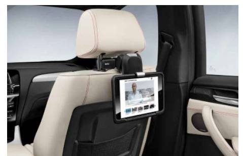
BMW iPad holder