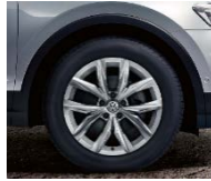
18" Kingston 235/55