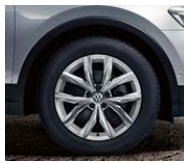
18" Kingston 235/55