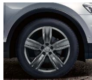
19" Victoria Falls 235/50