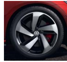
18" Milton Keynes Allow Wheel (225/40)