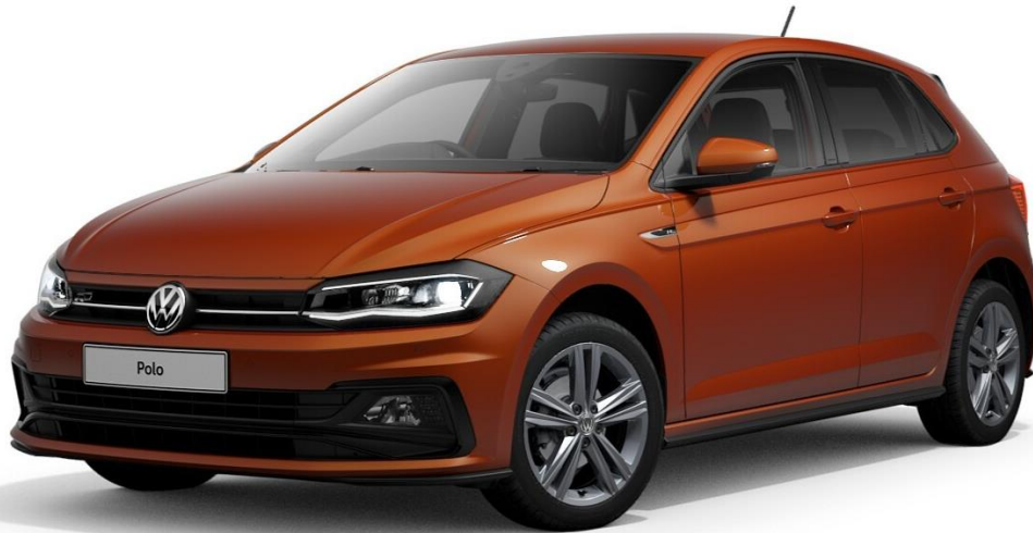
TSI R-Line DSG shown