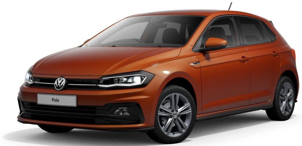
TSI R-Line DSG shown