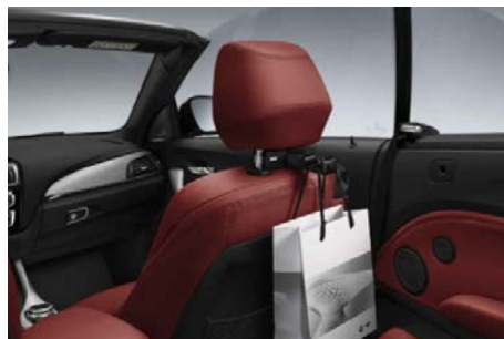
BMW Travel & Comfort System – universal holder