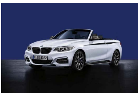
BMW M Performance 19" 624M Alloy wheels