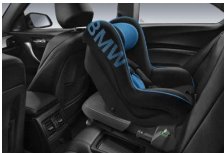
BMW Junior Seat

For more information, please contact your preferred BMW Dealer who will be pleased to advise you on the full range of Genuine BMW Accessories, or visit bmw.co.nz/accessories .