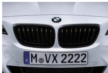
BMW M Performance Black Kidney grilles