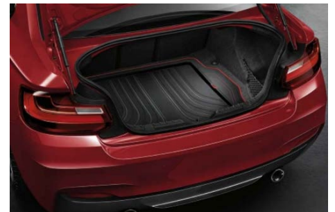
BMW Luggage Compartment