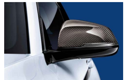
BMW M Performance Carbon Fibre Mirror Caps