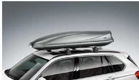
BMW Roof Racks and Roof Box