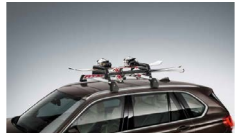
BMW Ski and snowboard holder