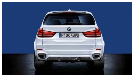
BMW M Performance Rear Carbon Fibre diffuser and Aerodynamic attachments