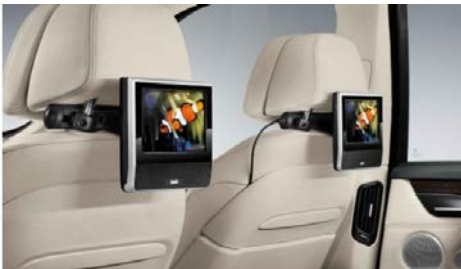
BMW Tablet DVD system

For more information, please contact your preferred BMW Dealer who will be pleased to advise you on the full range of Genuine BMW Accessories, or visit bmw.co.nz/accessories .