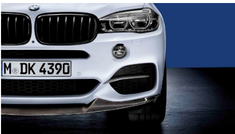
BMW M Performance Carbon Fibre diffuser and Aerodynamic attachments