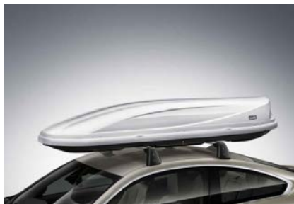
BMW Roof Box