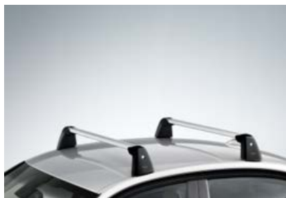
BMW Roof Racks

For more information, please contact your preferred BMW Dealer who will be pleased to advise you on the full range of Genuine BMW Accessories, or visit bmw.co.nz/accessories .