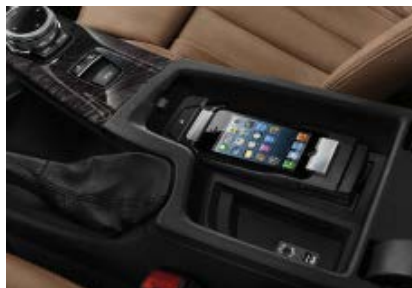
Snap in Adapter for iPhone, Samsung and HTC one