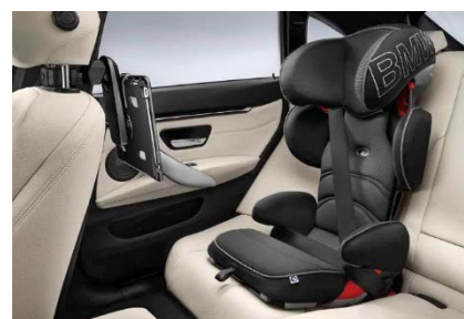
BMW Junior seat 2/3 black