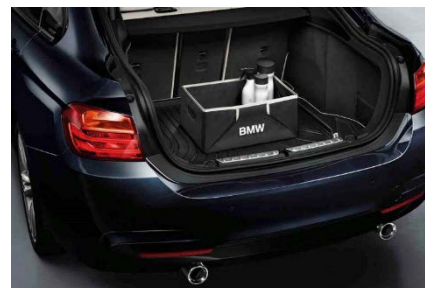
BMW Luggage Compartment mat & BMW folding box