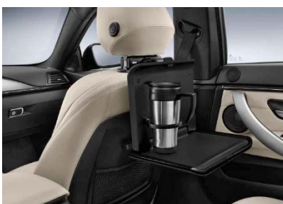
BMW Travel and Comfort folding table